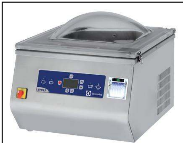
Table Top Vacuum Packer with HACCP Label Printer -20 m 3 /h Vacuum Packers