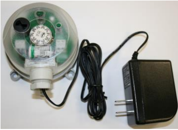
Pressure Alert with 6' Power Cord