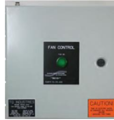
Fan Control UL Approved