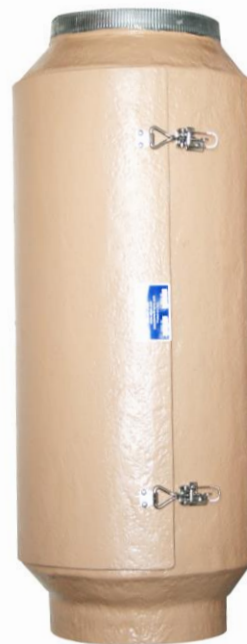
LLB Fiberglass Model