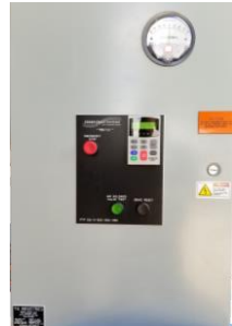
Equalizer VFD Control UL Panel