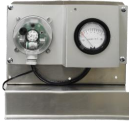
SPM-BB Static Gauge w/ Pressure Switch