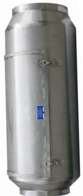
LLSB Stainless-Steel Model