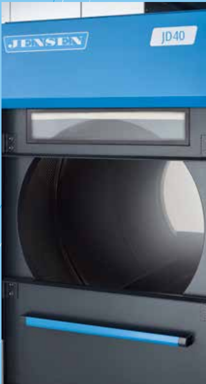
Fast loading and unloading with wide hatch, sliding doors