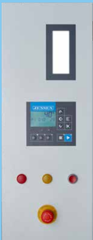
Remote awareness and user-friendly diagnostics function: Instant overview of machine status with the smart indicator light.