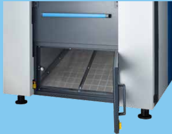
Easy lint removal with the easy-to-access air filters