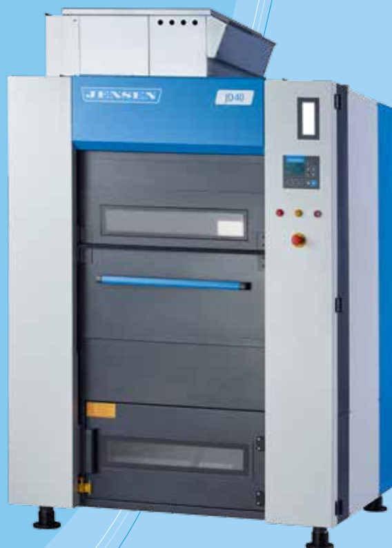
Space-saving and service-friendly: The new JTD dryers set new benchmarks.